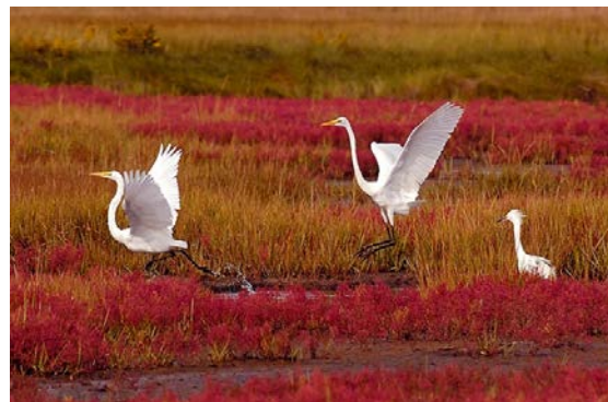
Egrets in a Massachusetts marsh