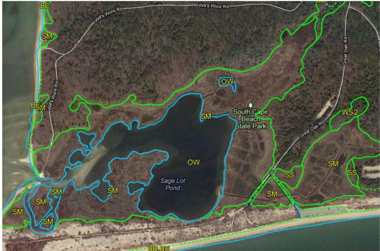
Image of "Bringing Wetlands to Market" study area from MA wetlands viewer

Try checking on line to see if your state has a wetland mapping tool. The maps may be slow to load because of the large size of the image files.