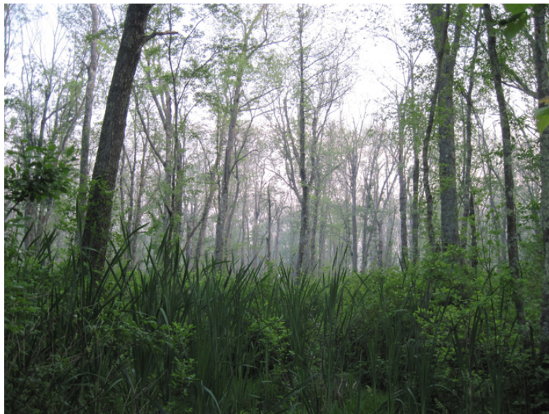
A swamp in Bridgewater, MA