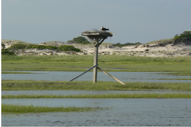
Osprey nest in a Massachusetts salt marsh

Wetlands and coastal ecosystems provide important services for wildlife and people